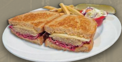
New York Deli Reuben