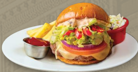
8oz South West Burger