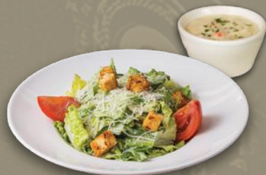
New England Clam Chowder Soup (Cup)