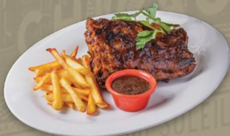
Roasted U.S. Baby Pork Ribs (Half Slab)