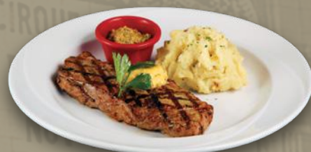
10oz New York Striploin Steak