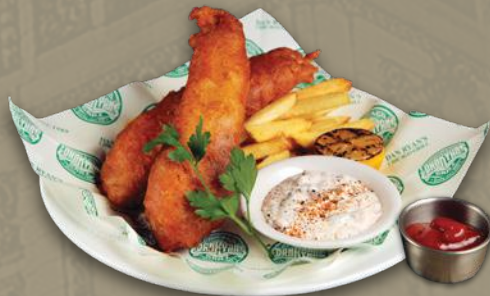
Fish and Chips