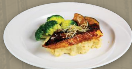
Roasted Miso Halibut