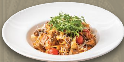
Beef Steak Fettuccine