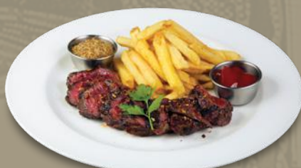
8oz Hanger Steak